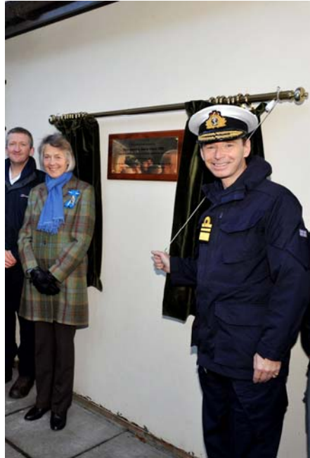
Vice Admiral David Steel CBE, the Royal Navy's Second Sea Lord unveiling the commemorative plaque, with Lady Sue Large, High Sheriff of Powys

The building that is now the Naval Outdoor Leadership Training Centre was formally the old Stationmaster's Cottage at Pant-y-Rhiw Station on the Brecon-